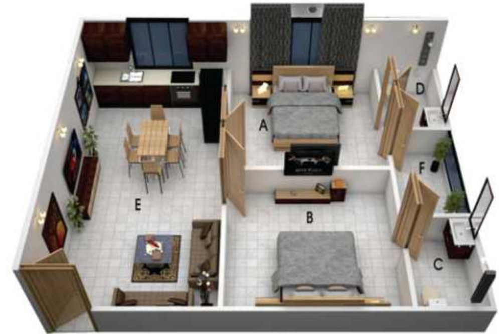
3 ROOM APARTMENT TYPE "D"