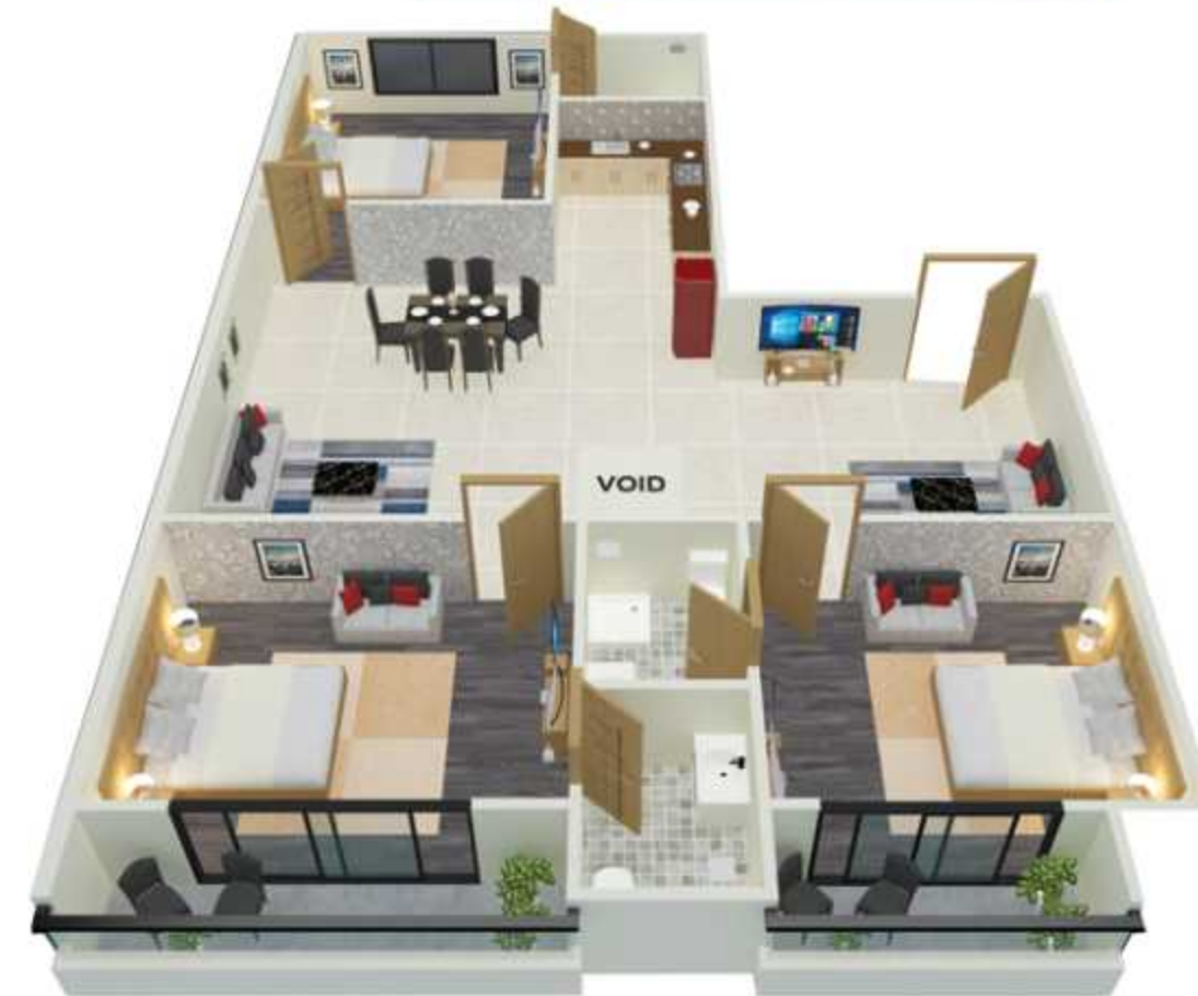
4 ROOM APARTMENT TYPE "C"