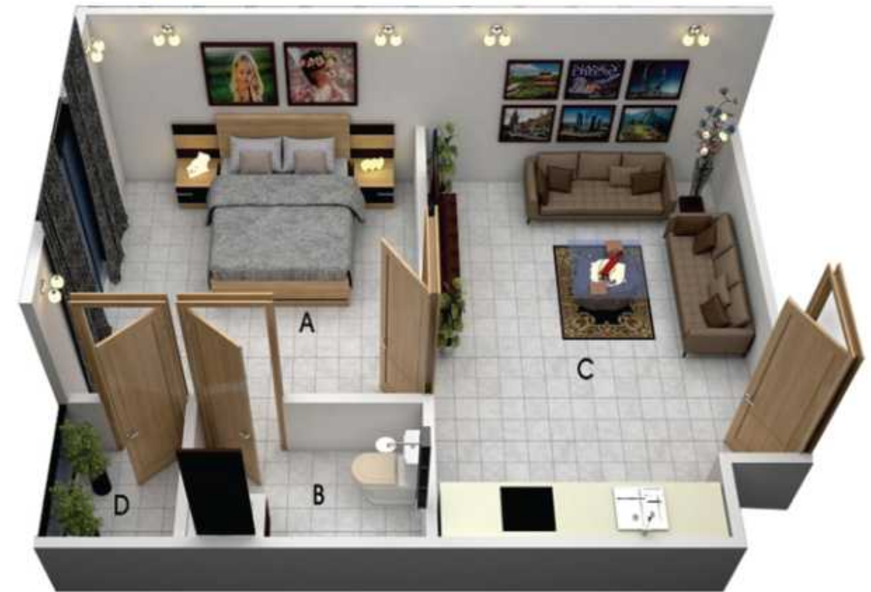
2 ROOM APARTMENT TYPE "A"